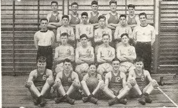
"St. Vincent" and "Ganges" Basketball teams.

This term's basketball started with the Inter-Divisional League which was eventually won by Benbow Division. Towards the end of October about a dozen boys received special coaching, and we were able to produce a team on 3rd November that beat "St. Vincent" 23-8.