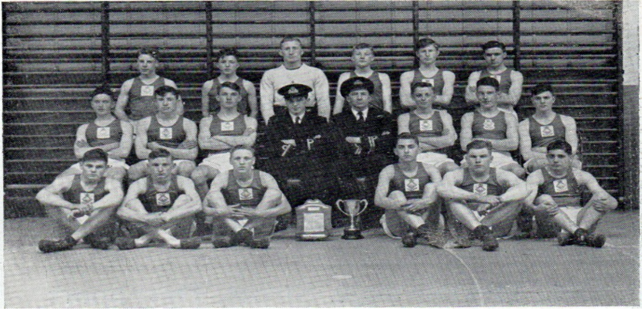
"Ganges" Cross-Country Team.

On returning from leave, Divisions plunged into training their Cross Country teams for the Senior and Junior Inter-Class and Inter-Divisional races that were run on 24th January. The Senior Inter-Class trophy went to 92/93 Blake and the Junior to 362/363 Collingwood Classes. Hawke Division won the Inter-Divisional trophy, having the best all-round average whilst, only after a recount, was it established that Collingwood had gained second place by 2.8 points!