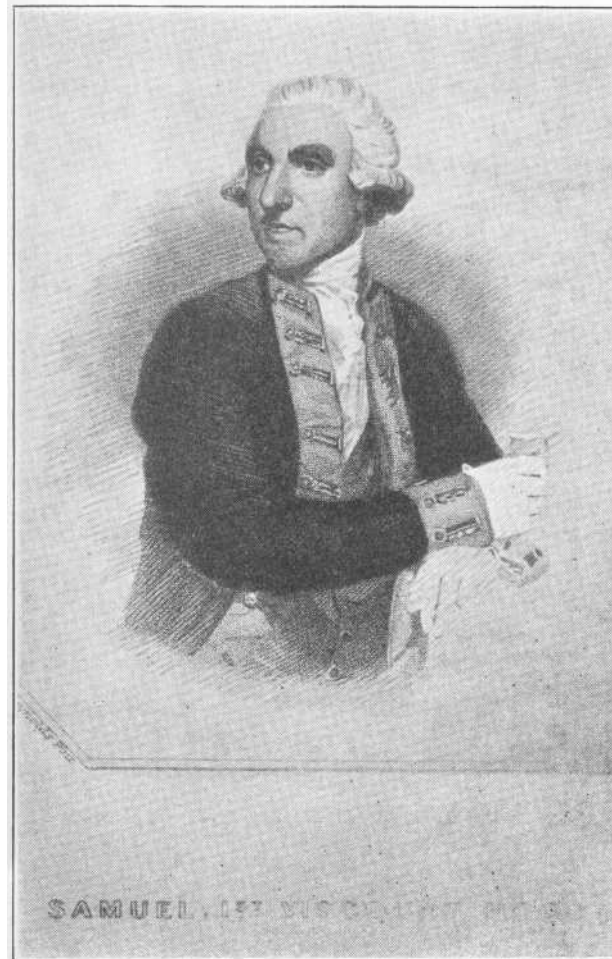
SAMUEL, 1ST VISCOUNT HOOD

Lord Hood's fame rests mainly on his masterly ability as a tactician, and Nelson, who served under him, held him to be the ablest of our admirals in the early years of the revolutionary war. It is said that a plan which Hood drew up for an attack on a French fleet at anchor had some share in inspiring the plan of attack which Nelson adopted at the Battle of the Nile.