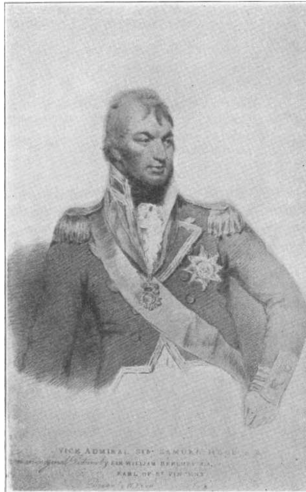
VICE-ADMIRAL SIR SAMUEL HOOD, K.B.

Thus ended a career which was almost entirely passed on active service.