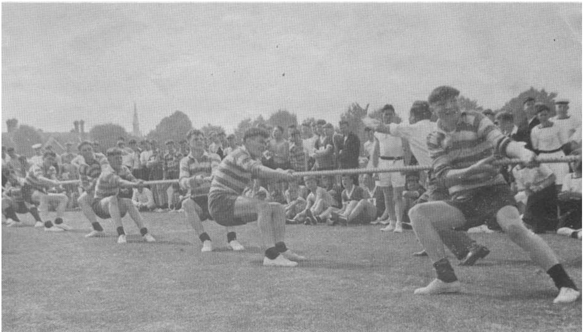
Anson Tug of War Team

there is plenty of hidden sporting talent amongst the junior classes so let's go flat out next term to fill the trophy case. J.G.