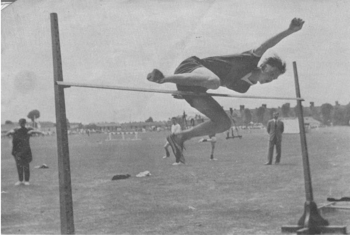
Briers - High Jump