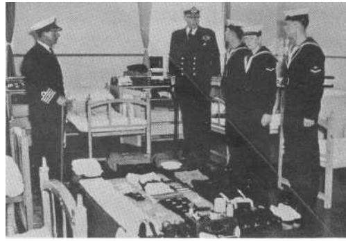
C-in-C inspects 401 Dormitory